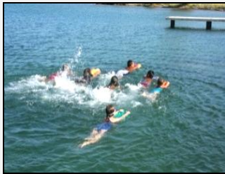
Water Safety Day in Elmo